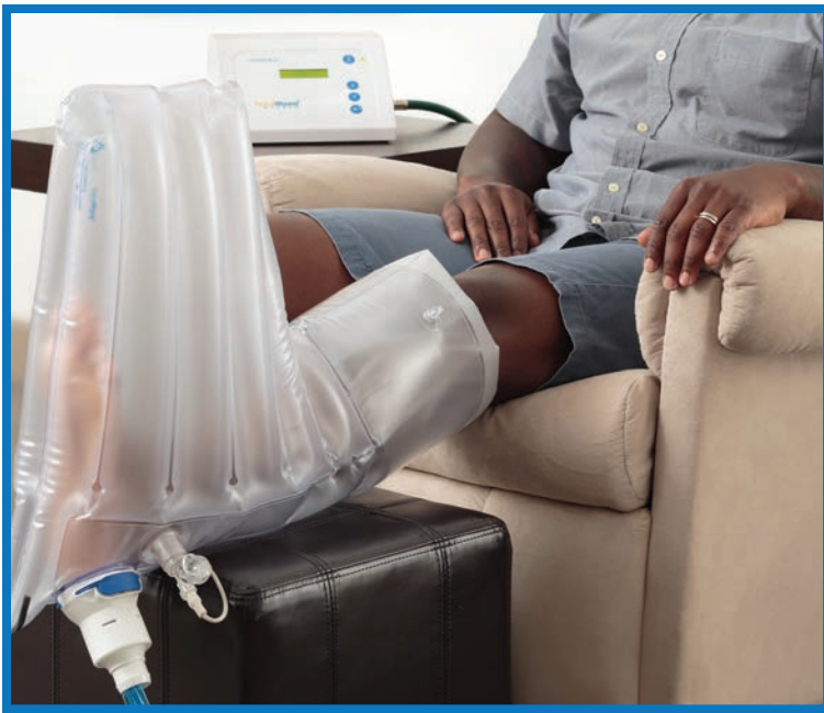
Single-Use Extremity Chamber

The TWO 2 therapy Extremity Chamber is available in medium and large versions to meet your specific patient needs. The system operates by applying cyclical oxygen pressure directly to the wound site within a sealed humidified environment. This provides a greater oxygen diffusion gradient and increased tissue oxygenation. TWO 2 therapy can be performed without removing gas permeable dressing, with the large version accommodating larger limbs and allowing diffusion through conventional compression dressings, UNNA Boot & total contact casts.